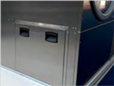
Side fluff filter