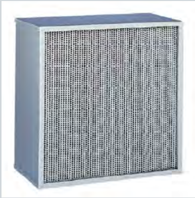
HEPA 13/14 air filter