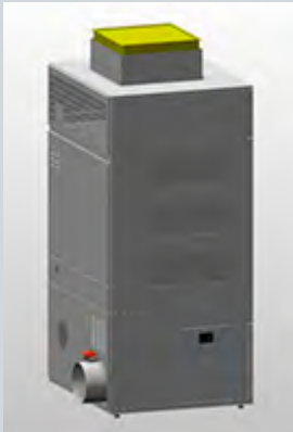
HEPA air filter in mod. DTT-28 to 80