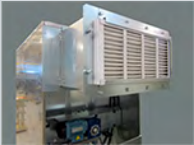
Filter + Prefilter