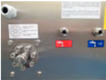
Pack stainless steel connections