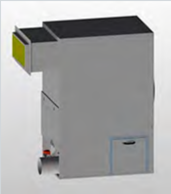
HEPA air filter in mod. DTT-11 to 23