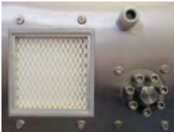
HEPA air filter